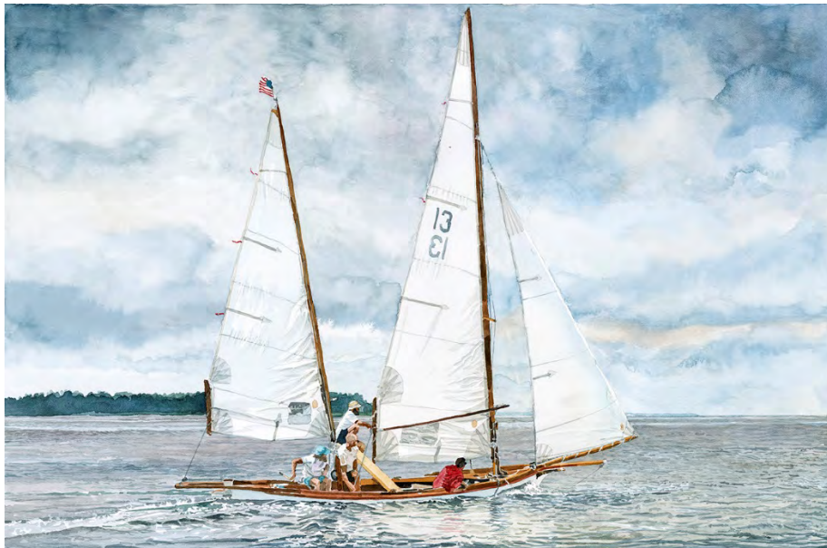
Tiny Dancer / Bufflehead